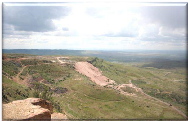
Figure 2: Picture of Almaden (Nutmeg Mountain) Property

The Almaden (Nutmeg Mountain) Property currently hosts a National Instrument 43-101 compliant measured resource of 239,000 ounces of gold (9,807,000 tonnes grading 0.758 grams per tonne ("gpt")), an indicated resource of 625,000 ounces of gold (29,248,000 tonnes grading 0.665 gpt) and an inferred resource of 84,000 ounces of gold (4,781,000 tonnes grading 0.546 gpt), at the cut-off grades of 0.274 gpt, 0.411 gpt, and 0.790 gpt for the oxide, mixed and sulfide mineralization, respectively. Please see the 43-101 report filed on www.sedar.com for further information.