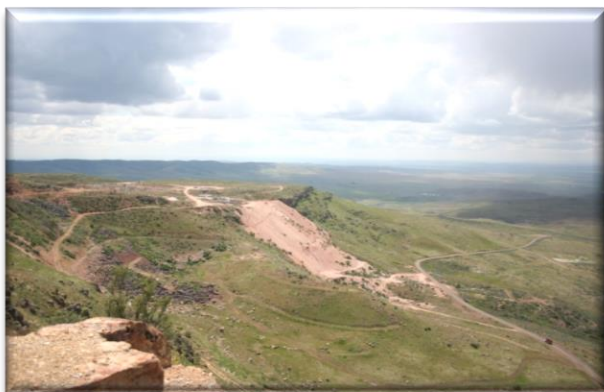
Figure 2: Picture of Almaden (Nutmeg Mountain) Property

For the period ended January 31, 2017, the Company expended $148,996 at the Almaden (Nutmeg Mountain) Property, which increased the exploration and evaluation assets associated to the advancement of the Almaden (Nutmeg Mountain) Property to $19,524,696.